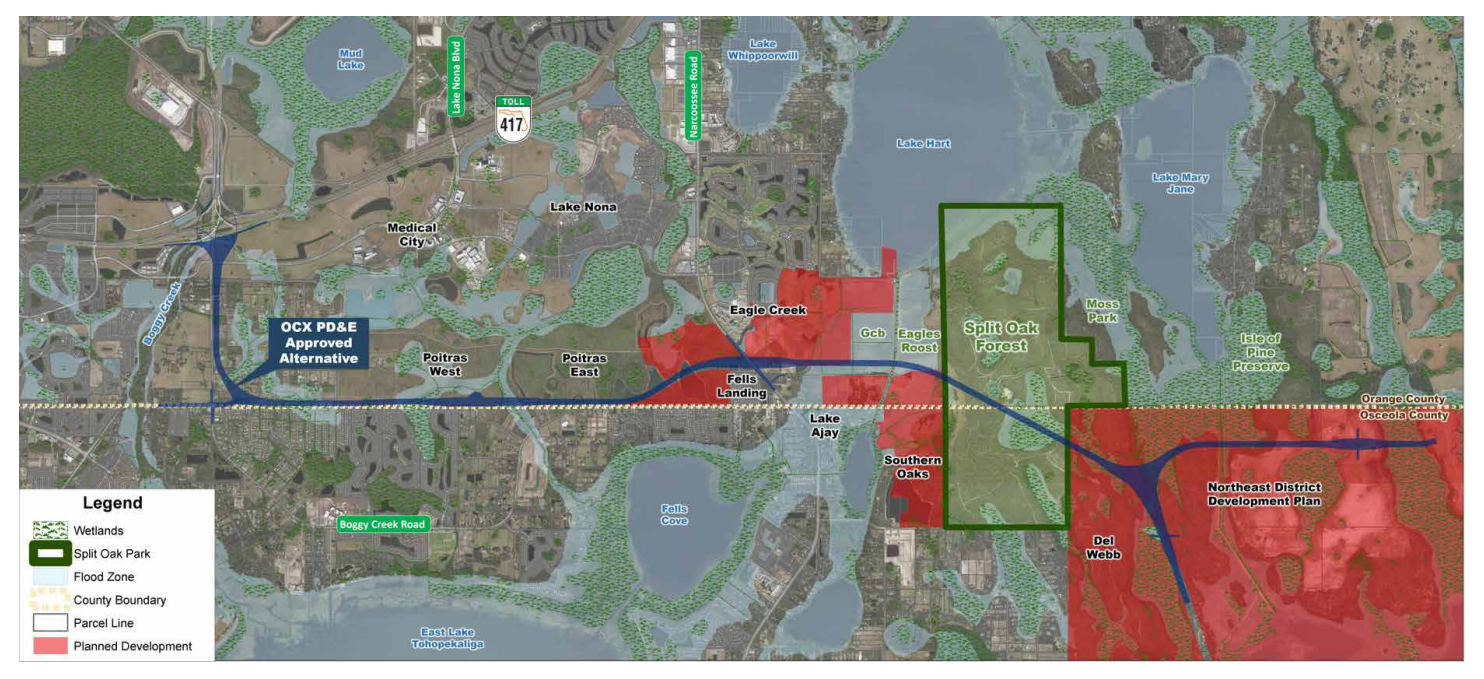
FIGURE 2: PD&E STUDY RE-EVALUATION PREFERRED ALTERNATIVE RECOMMENDATION