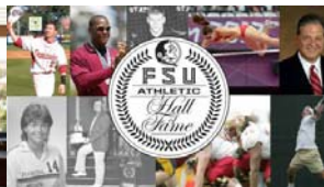
2016 Hall Of Fame Class