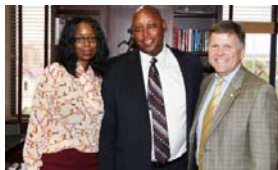
Frontier Communications-FSU Sign 3-Year Partnership