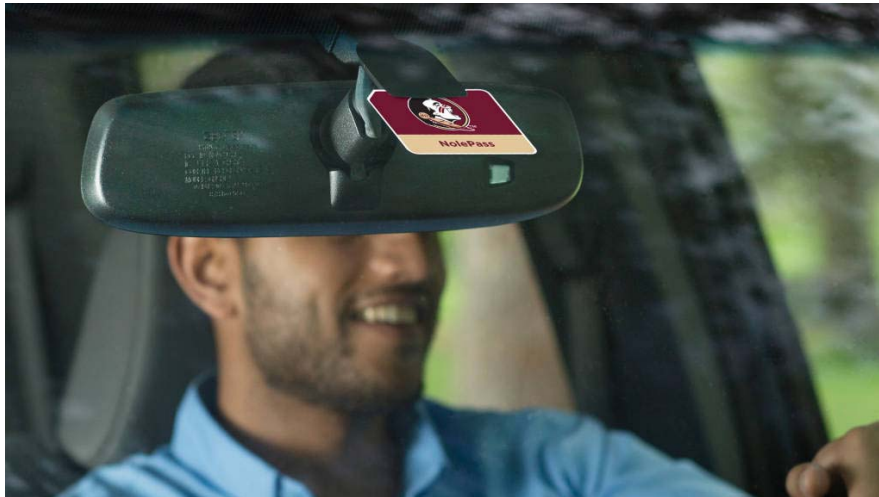
Florida State Athletics