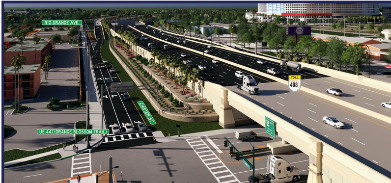
Eastbound SR 408 off ramp to US 441 (Orange Blossom Trail).*