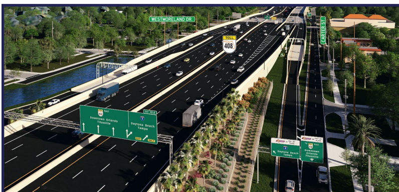
New eastbound SR 408 and I-4 on ramps from US 441 (Orange Blossom Trail).*