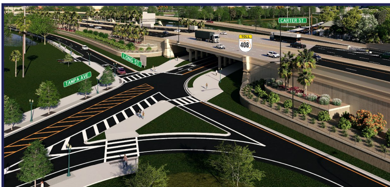
Improvements at Tampa Avenue and Long Street.*