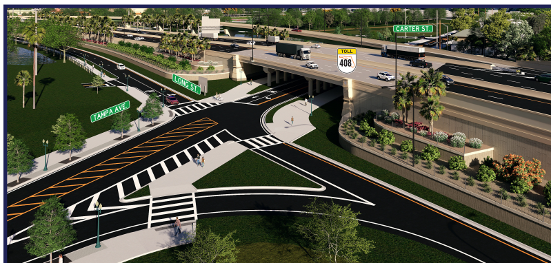
Improvements at Tampa Avenue and Long Street.*