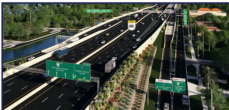
New eastbound SR 408 and I-4 on ramps from US 441 (Orange Blossom Trail).*