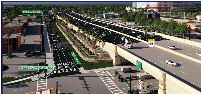
Eastbound SR 408 off ramp to US 441 (Orange Blossom Trail).*