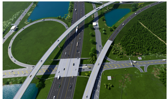
Rendering of the SR 516/SR 429 interchange

CFX Advancing Sustainability Through Powered Infrastructure for Roadway Electrification (ASPIRE) Pilot Project will test a solution that “brings the charge to the vehicle” for both consumer and commercial electric vehicles through the electrification of the roadway to charge vehicles at highway speeds. The pilot project will introduce a wireless charging system installed within a 3/4 mile long section of the travel lanes of Segment 1 of SR 516 (see project map). The system will only work on specially equipped vehicles that will be used for initial testing of the charging lane.