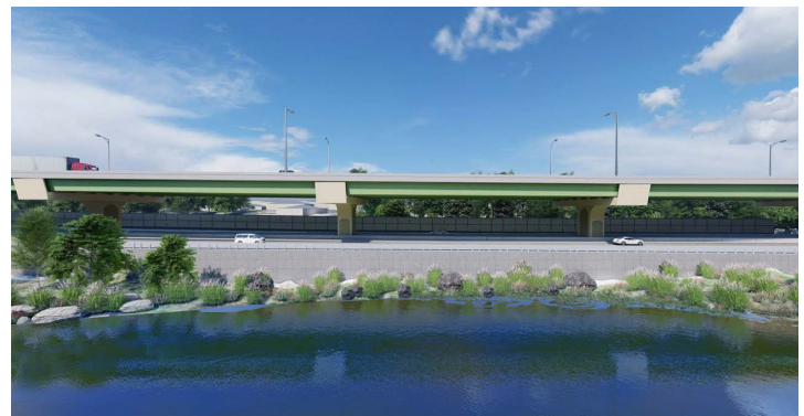
Preliminary conceptual rendering of the SR 414 Expressway Extension and Maitland Boulevard from the vantage point of Lake Bosse. Subject to change.