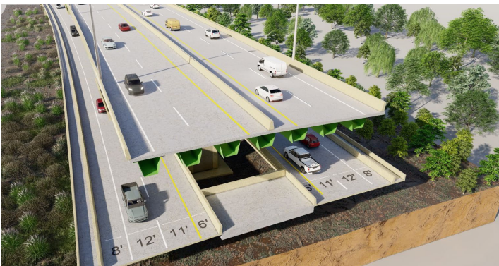
Preliminary conceptual rendering of a typical section of the corridor. Subject to change.