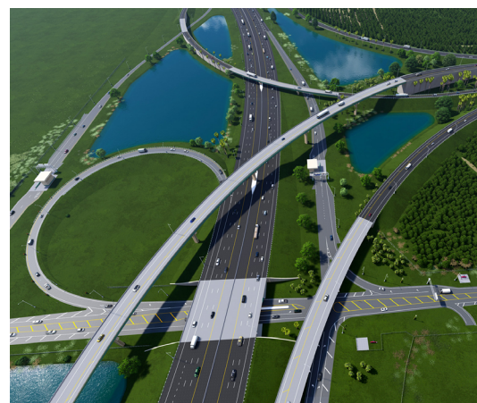
Rendering of the SR 516/SR 429 interchange